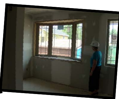
Window in Patient Room