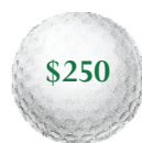
TABLE SPONSOR A Reserved Dinner Table, Hole and Placemat Sponsor.

TOURNAMENT SPONSOR Business/Organization Banner displayed during event, Complimentary Foursome, Table, Hole and Placemat Sponsor.