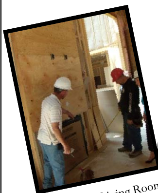
Fireplace in Living Room

The hospice board and staff are hoping to be ready to accept the first residents in September.