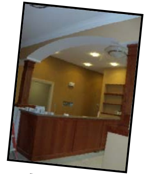
Front View Nurse's Station