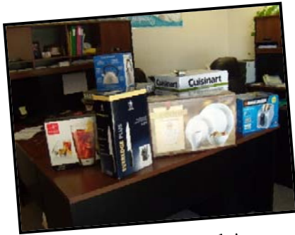
Gifts arriving daily!