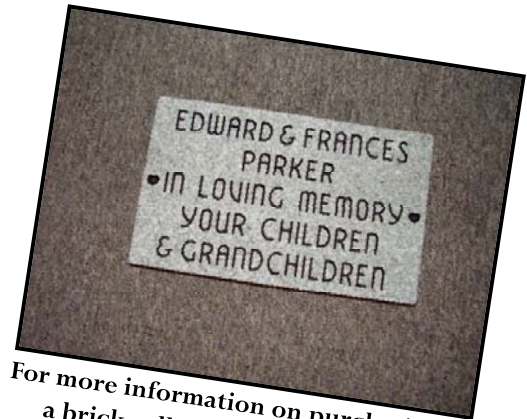
For more information on purchasing a brick call the Hospice Office