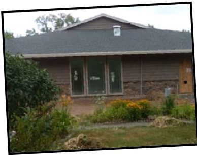
Chapel Windows From Memorial Garden